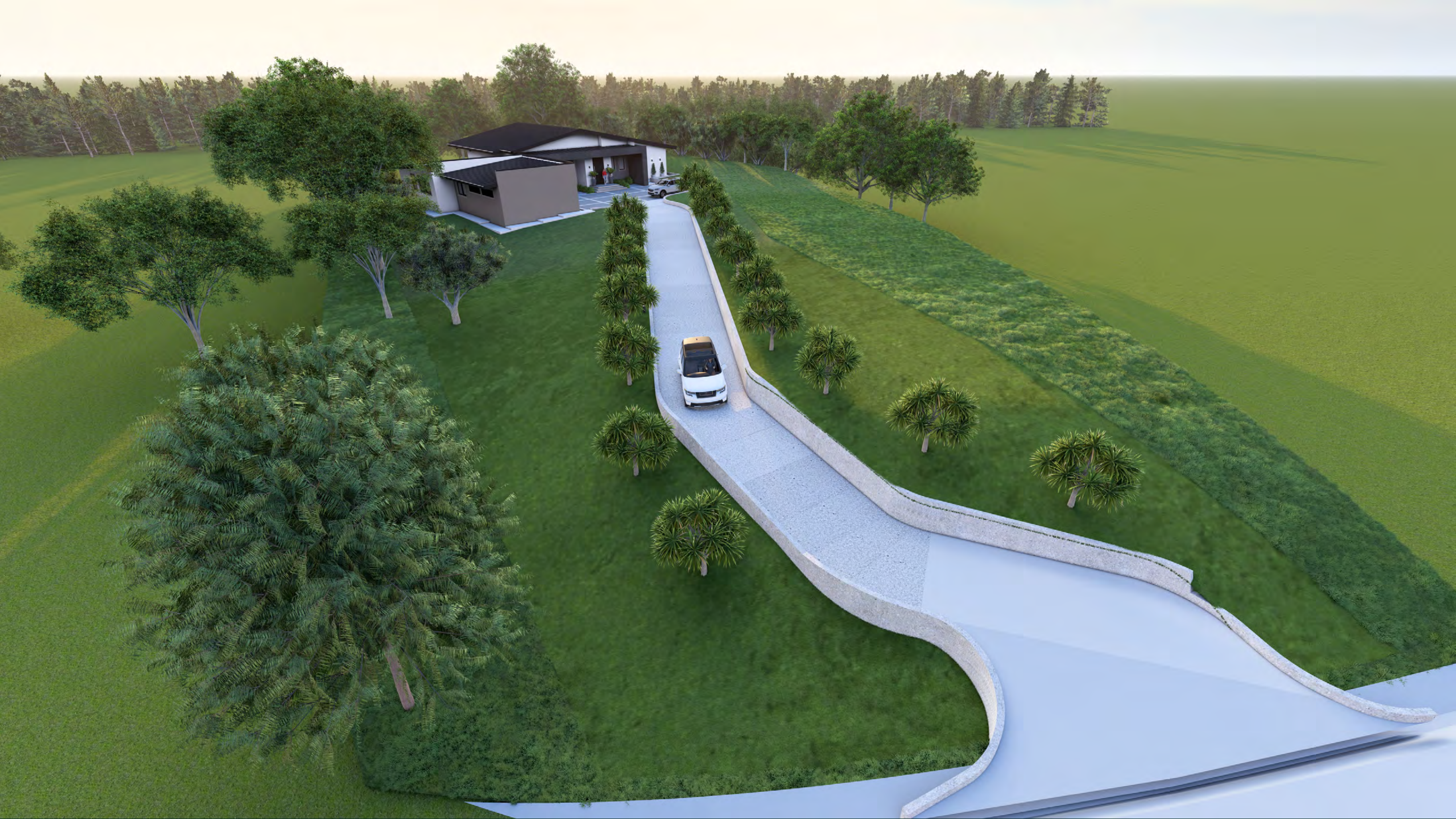
LOT 3 DRIVEWAY